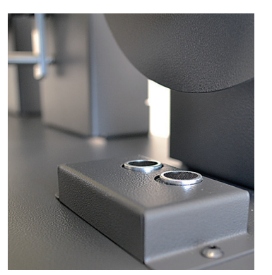
The ultrasonic sensor is used to adjust automatically and electronically the tension on the media despite the roll diameter variation. With this feature it is possible to get extremely tight finished rolls.