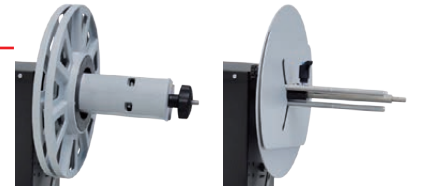
Fixed core holder