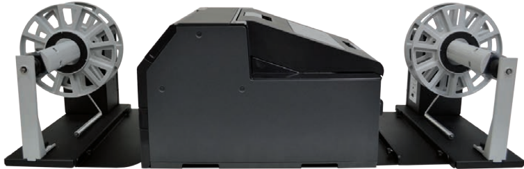
LABEL REWINDER (RW6500A) - Epson C6500A printer - LABEL UNWINDER (UW6500A) (Not included)

The Roll to Roll system specifically designed for Epson C6000A / C6500A color label printer can handle rolls up to 220mm (8.66") media wide and having an outside diameter up to 250mm (10"). Both Unwinder and Rewinder are equipped with a fixed 3" core holder.