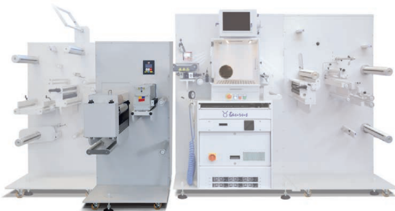
UV Varnish module inline with Taurus

Easy to use, it allows an alternative media protection to the classic cold lamination to offer a superior finishing level.