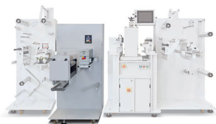
UV Varnish module inline with Aries