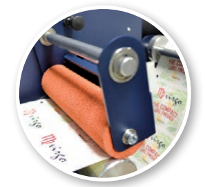
Sponge pressing roll