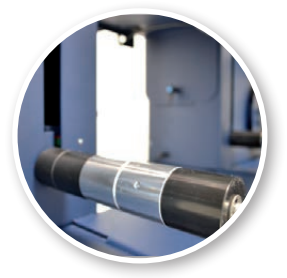
Ultrasonic tension arm