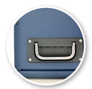
Handles (two for each side)